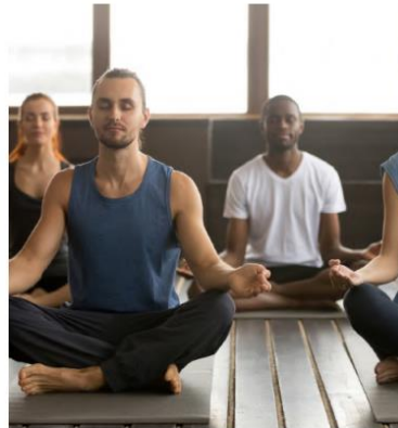
TWO EXERCISE ROOMS