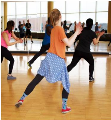
DANCE/ BALLET ROOM